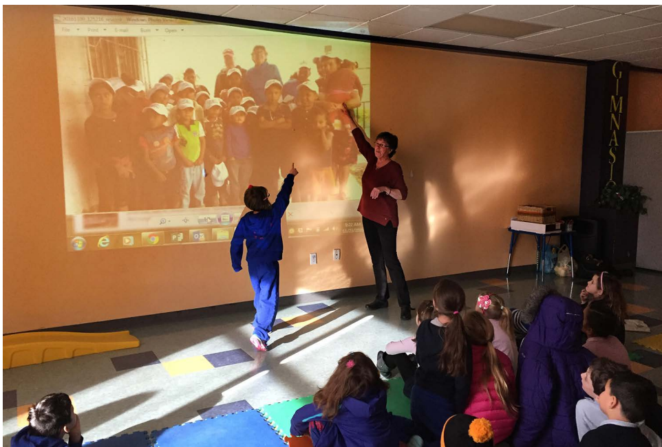
Children at Su Escuela, a bilingual school in Hingham, MA “meet” students from their new “sister” school in Plan Grande, Honduras.