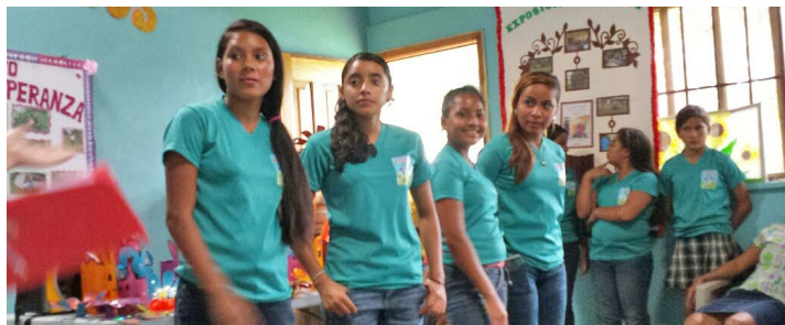
Girls Empowerment graduates in Yoro, November 2016

HH began supporting a local Girls Empowerment program in collaboration with COMVIDA, an in-country organization. The program is held during out-of-school hours at a small community center space in the center of Yoro. Activities include a wide range from discussions on sexually transmitted diseases, women's and girls' rights, hygiene and health to fun activities such as jewelry making, crafts, and photography. The girls work to maintain the center, recently painting it and creating a recreation area for younger member, making a swing set out of used tires. In November, the program held a celebration for the girls and their families to celebrate the end of the school year that included a photography contest, craft exhibition, and punta dance.