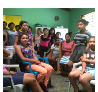
BH student meeting

The largest portion of the HH annual budget goes toward supporting educational programs. In Plan Grande, HH pays for a kindergarten teacher, and provides full financial assistance for 53 students to attend secondary school in Yoro (fees, uniforms, shoes, books & supplies). For students from San José, a six-hour round-trip hike from the nearest secondary school, HH maintains and staffs a Boarding House (BH) in Yoro so they can attend school. They live at the BH during the