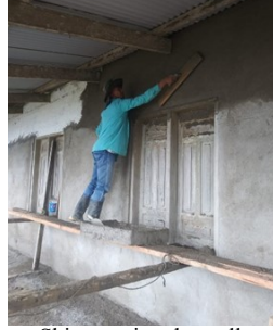
Skim coating the walls

Along with the repairs, a new solar panel was installed at the Clinic in January 2021, providing light and power and enabling the storage of medicines that need refrigeration, as well as charging for cell phones and computers.