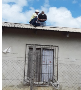
Installing solar panels

The Clinic and Nutrition Center are key to our ability to provide health and wellness services to the people of San José and the surrounding communities.