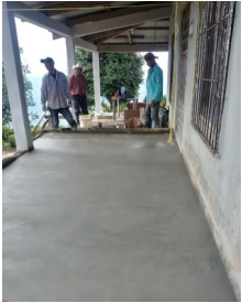
New Clinic porch