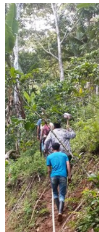
Running the water pipe down the mountain

They are also building several water holding tanks. Over 25 men are working together to repair the water system for their community.