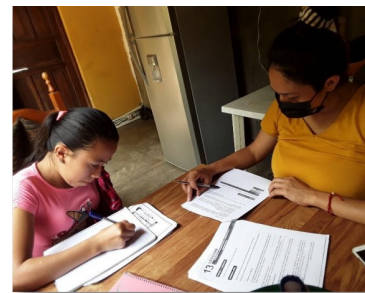
Tutoring session in a home

The tutors report, "These sessions are extremely important considering the new way of learning where students have to self-learn. Their parents are very appreciative of the support HH is providing, especially since many of them are unable to help due to their work schedule or level of education."