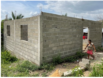
Reconstruction still in process

In November 2020, two Category 4 hurricanes hit Honduras two weeks apart. In Plan Grande and San José, the damage was extensive. Many homes were damaged, crops were lost and the water system for Plan Grande was destroyed.