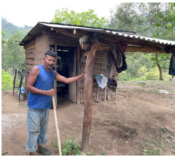
A new zinc laminate roof

Repairs are ongoing, and as you can see from these photos, the recovery process is well underway. Without your financial support none of this would be possible.