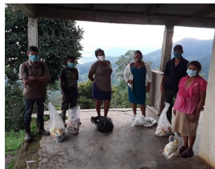
Food distribution in San José. Note the condition of the Clinic porch floor before it was rebuilt.

Prior to COVID-19, HH's Nutrition Program provided 3 hot meals a week to preschoolers in Plan Grande and San José. When this program was suspended in March 2020 due to safety concerns, hunger became an urgent problem. HH began distributing food to every family in both communities (100 families in PG and 45 families in SJ) twice a month at a monthly cost of $1300. This crucial safety net is made possible by your financial support. Thank you!