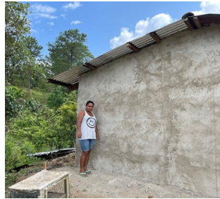
A new roof and skim coat

To help the communities rebuild, Honduras Hope allocated $9000 for repairs. These funds enabled families to purchase building supplies to repair or rebuild their homes.