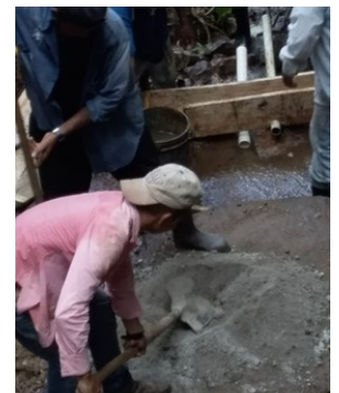
Working on a holding tank