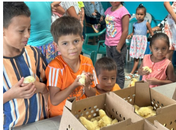
Pollitos in Plan Grande will improve nutrition