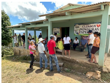
The San José Clinic gets a new nurse