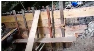
Work continues on the San José water system which needs more funds for completion