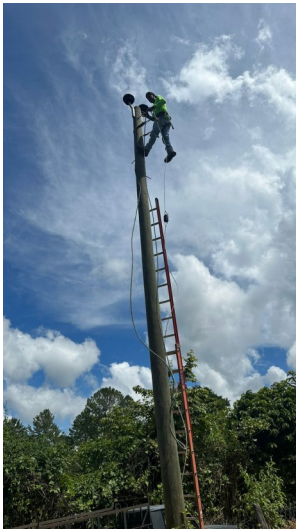
Electricity for Plan Grande