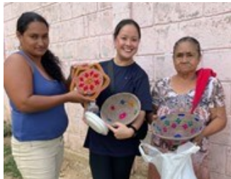
Women sell pine needle baskets to support their families